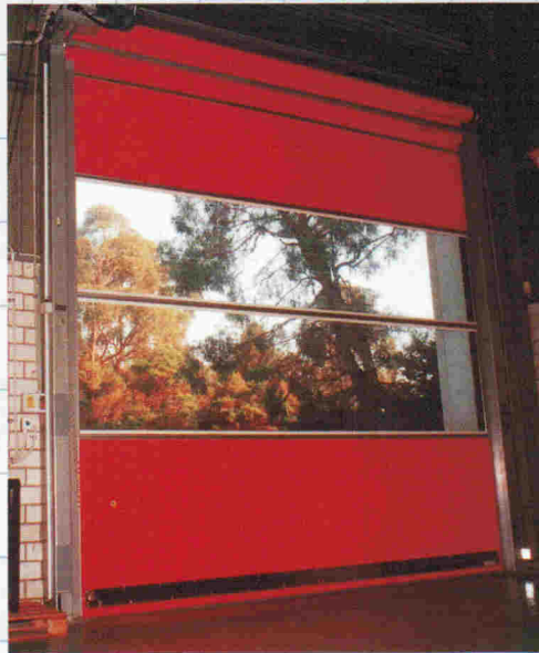
Combinations of clear sections to suit any application