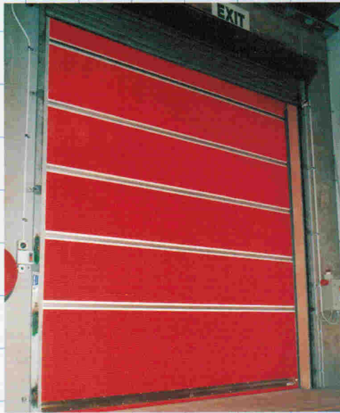
Large doors in exposed environments