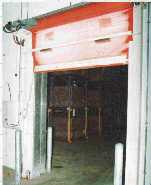
Special designs for freezers operating at - 30°C