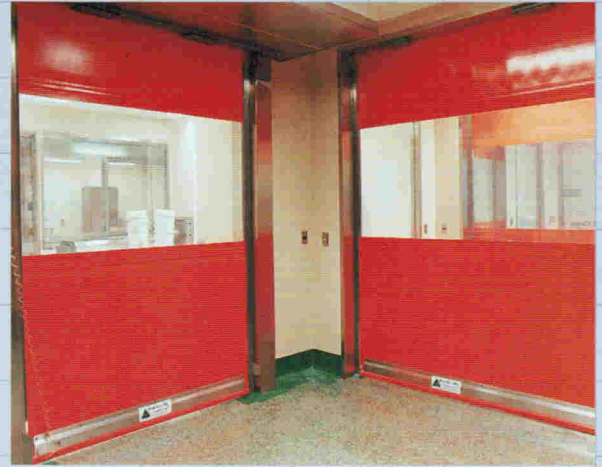
Stainless steel framing for special clinical or laboratory conditions

DMF International has been at the forefront of the Rapid Roll door industry for many years, and is Australia's largest exporter of this type of door. With full engineering design and manufacturing facilities, DMF has the capabilities to produce the right solution for your application.